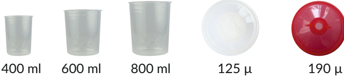
400 ml 600 ml 800 ml 125 μ 190 μ